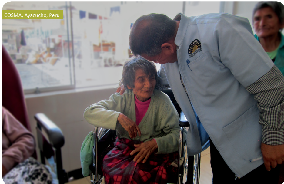
COSMA, Ayacucho, Peru

Fracarita International has a special consultative status in the Economic and Social Council (ECOSOC) of the United Nations. The NGO of the Brothers of Charity fully supports the United Nations Sustainable Development Goals (SDGs).