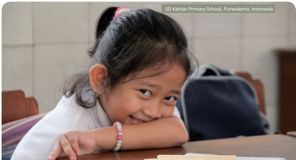
SD Karitas Primary School, Purwokerto, Indonesia

The NGO fully promotes the application of the UN resolutions regarding human rights without any form of discrimination such as that on the basis of functional impairment,