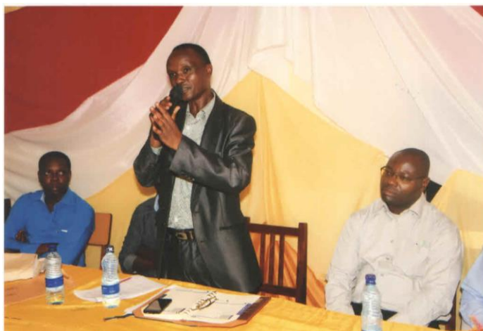
the Governmental Representative Head Officer of Community development and Social welfare.