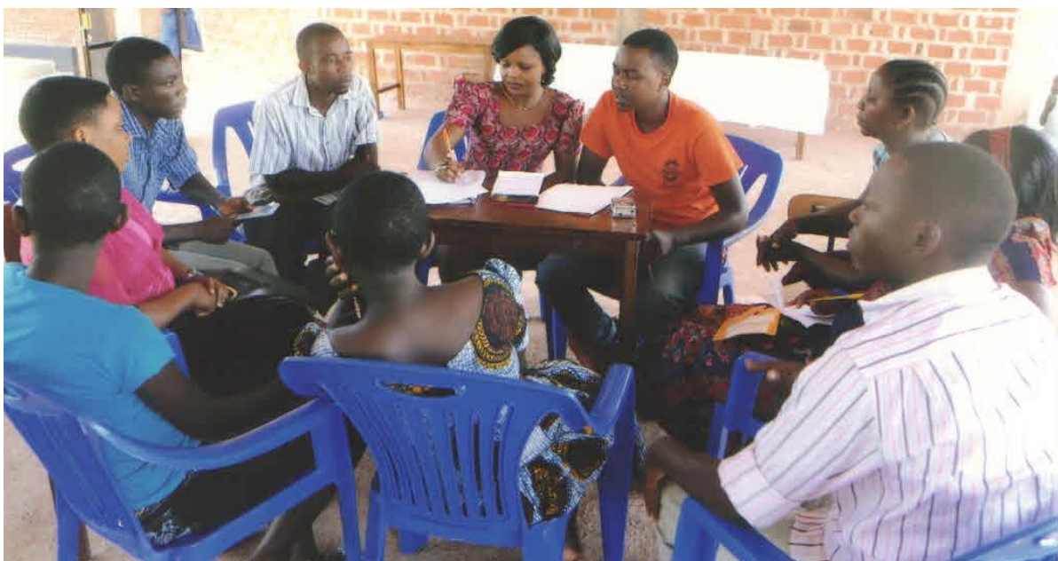
Group discussions and sharing