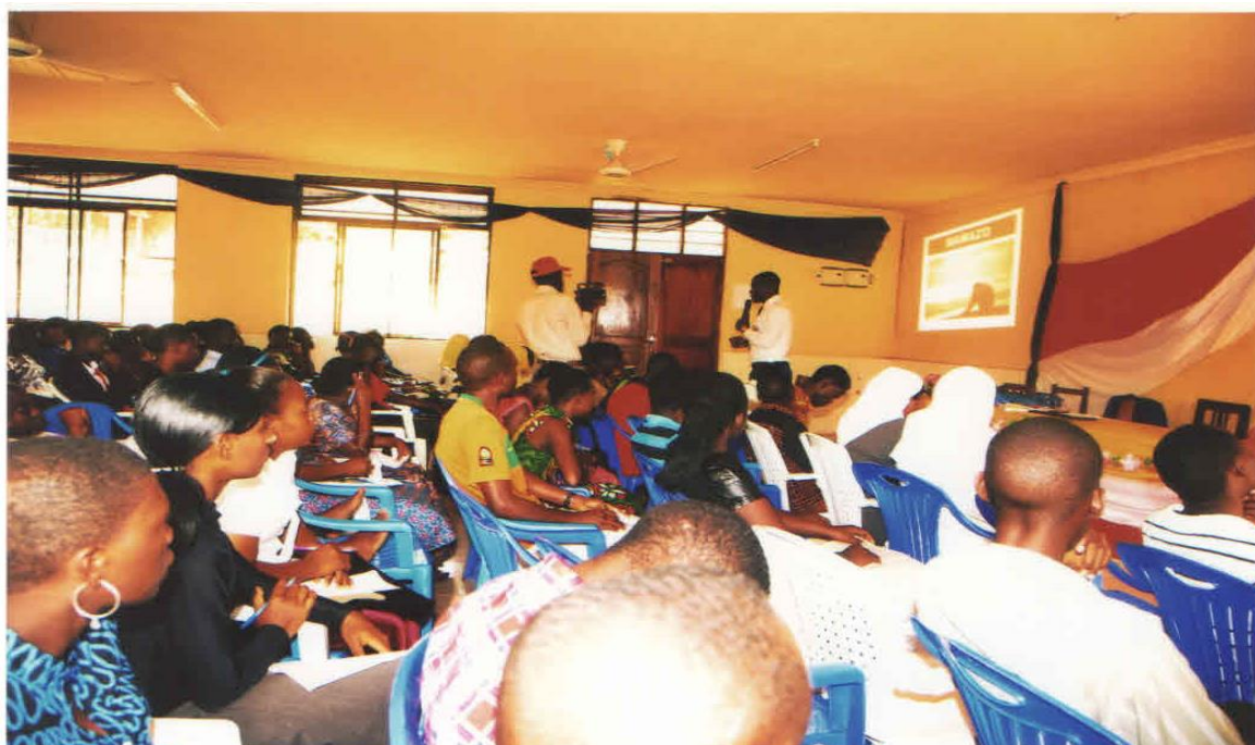
Participants during workshop

Fracarita International, Boeveriestraat 14, 8000 Brugge, Belgium Tel.: +32 50 44 06 90 www.fracarita-international.org Fracarita Tanzania Foundation , P.O.Box 612, Kigoma-Tanzania Email addresses: sd.development.gilbert@boc-tz.org / sd.development.im@boc-tz.org Tel: +255 7632 38594 / +255 7672 27024