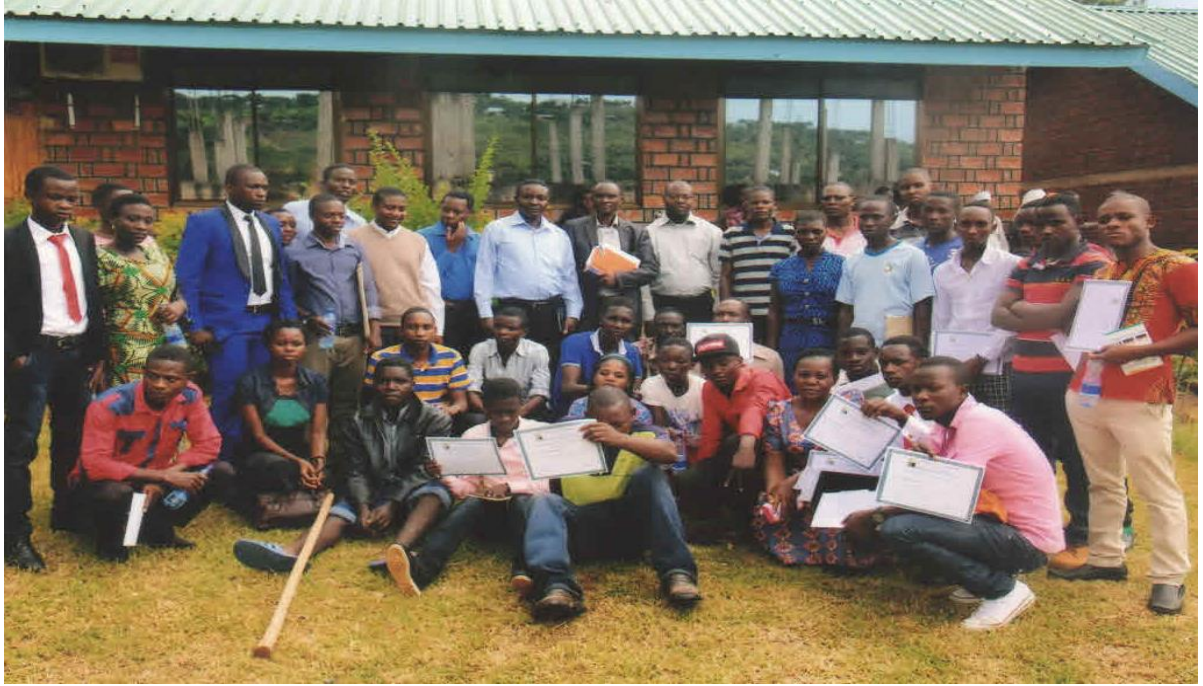
Certification and photo of the group (a part of participants) on the workshop.